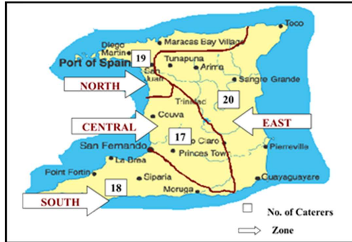
Figure 1: Zonal Boundaries of the SNP